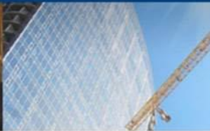
Engineering and Construction