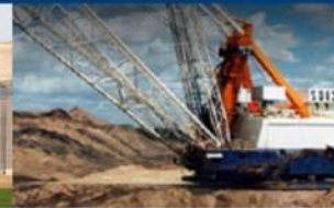
Metallurgy and Mining Industry