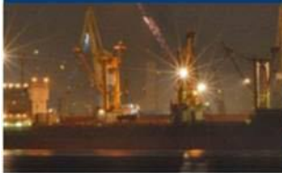
Port Business, Transport and Logistics