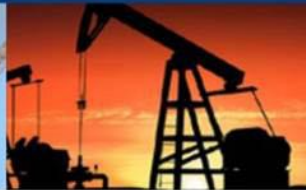
Oil and Gas Industry